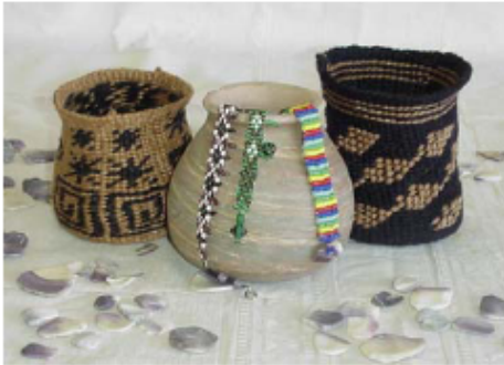
Handmade crafts by tribal members

The Wampanoag Community Center (WCC) will be a living cultural center for traditional and contemporary Wampanoag arts, crafts and lifestyles. The WCC will be the only facility of its kind in the community, offering services and space for Wampanoag community members to gather for various activities.